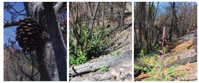
Examples of post-fire revegetation types. (Left to right) Seed bank, resprouts, and dispersed seed.

He adds, "90 percent of the trees we measured were still living under the shrub canopy. So a big question is; are they going to survive and come out beyond the shrub cover?"