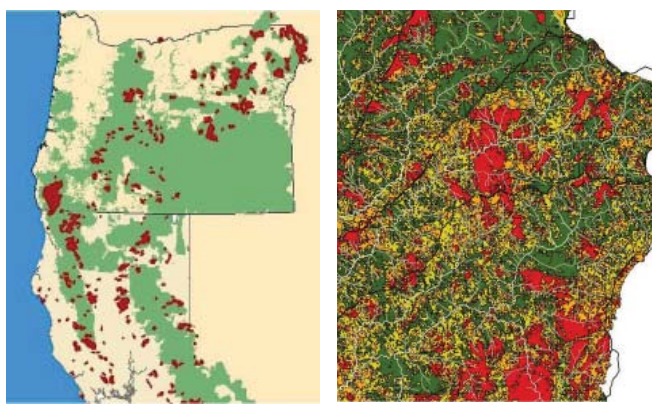
Large wildfires from 1970–2002 in California and Oregon (left) and the Biscuit fire severity (right).

Today it is unclear whether the proportion of high severity fires has increased in certain areas. But it is very apparent that some of today's fires contribute to questions of how to manage the areas post-fire. For example, from 1970 to 2004 more than 600 wildfires burned almost 15 million acres (over six million hectares) in California and nearly 5 million acres (two million hectares) in Oregon, according to a paper in the Journal of Forestry (April/May 2007). In 2002, the Biscuit Fire—the largest fire ever recorded in Oregon—burned almost 500,000 acres (200,000 hectares) of the Rogue/Siskiyou National Forest.