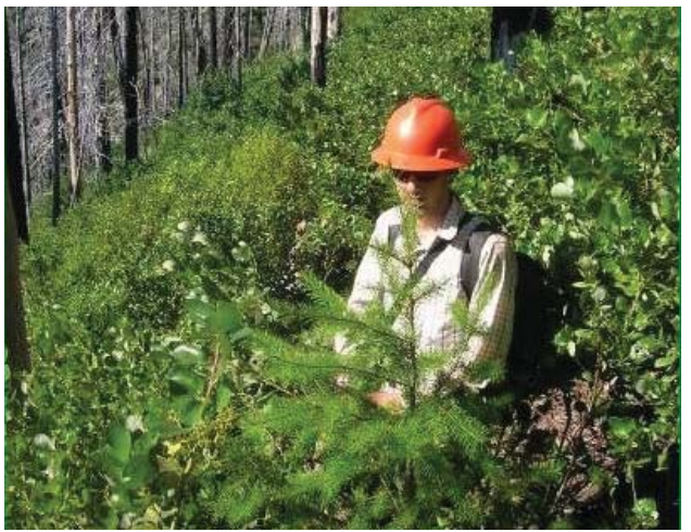
Sampling post-fire revegetation. Shrubs are dense and diverse, tree seedlings abundant.

The researchers did find that conifer density varied by elevation, or series." We saw that the lowest elevation (drier) sites tended to have the fewest conifer seedlings, while the higher elevation sites had much more. But even then, the low elevation sites had an average of 1,694 conifer seedlings per hectare (4,184 per acre)," says Hibbs. "The biggest point here," says Hibbs, "is that there are a lot of vigorous seedlings."