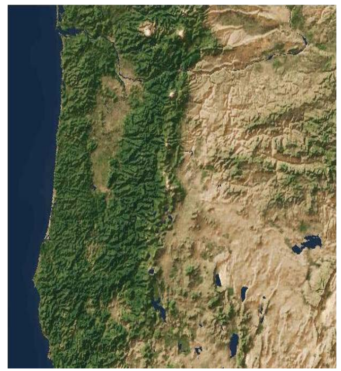
The Klamath Siskiyou Region.

They sampled in the three most common plant series, according to the USDA Forest Service plant series designations. They were low (also called the Douglas-fir series, and lowest in elevation), medium (the Douglas-fir/ tanoak series), and high (the white fir series) elevation plots. They also assigned plots at various distances from the burn edge; which determines how far the plots are from conifer seed sources. They wanted to know if distance from a seed source affected the area's ability to regenerate naturally. Hibbs explains, "We wanted to see if we find more seedlings near living trees than further away from them."