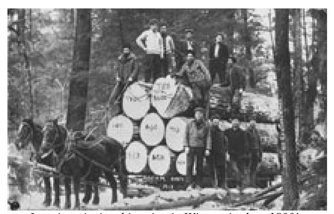
Logging virgin white pine in Wisconsin, late 1800's www.ci.green-bay.wi.us

Xcel also blamed "considerable regulatory uncertainty at the state and federal level" for their decision not to build.