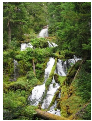
Willamette National Forest, Oregon

Passed on Dec. 13, 2010, Section 707 of the Tax Relief, Unemployment Insurance Reauthorization and Job Creation Act of 2010 (HR 4853) extended for one year (through December 31, 2011), the eligibility deadline for 1603 applicants to begin