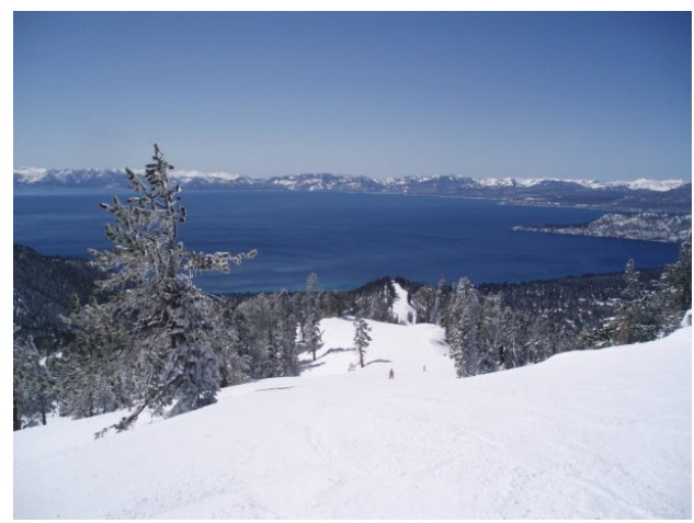
Lake Tahoe, California

"The grassroots effort was just one piece of the puzzle," said Dawn Baffone of The Lake Tahoe Anti-Biomass Plant Coalition , "but was a big factor in keeping the plant out of this residential area in Kings Beach."