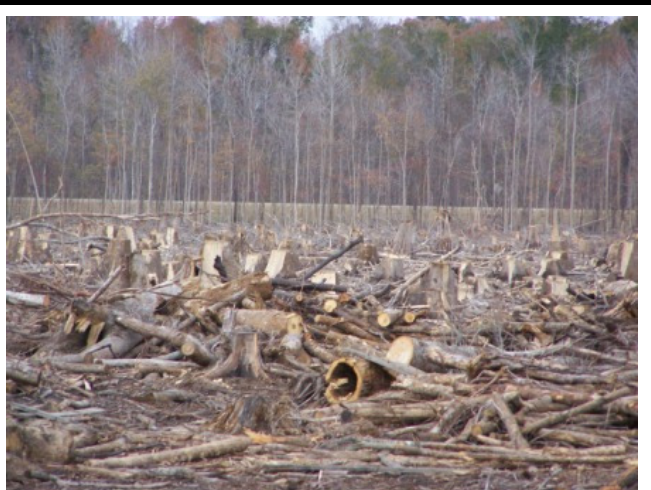
Clearcut outside of Green Swamp, N. Carolina